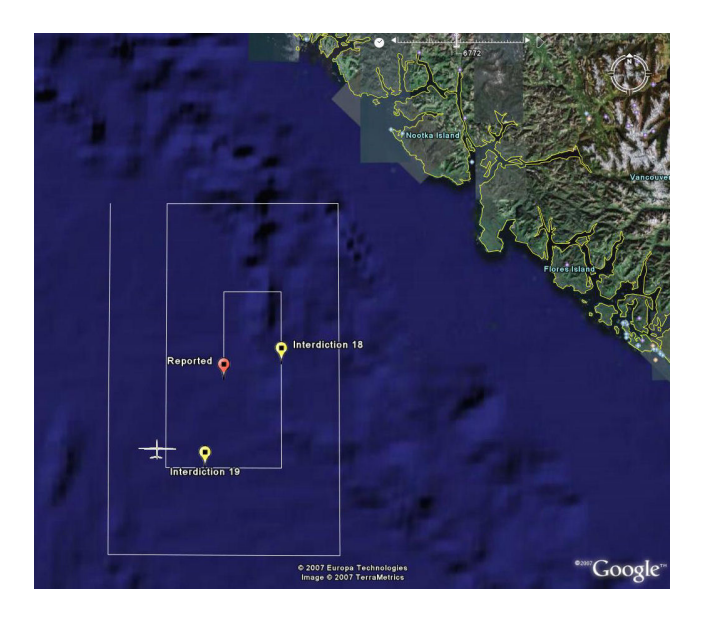
Figure 3: Visualization Tool - SAR mission

infeasible event time. In the following sections, we will describe each entity in detail along with a simple BNF syntax that we have implemented into our dynamic resource scheduling framework.