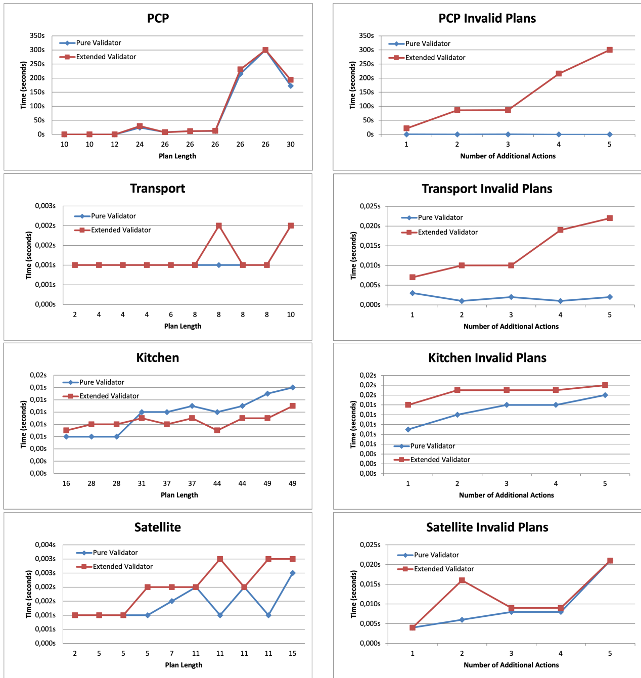
(a) Comparison of runtimes (seconds) as a function of plan length (valid plans). (b) Comparison of runtimes (seconds) as a function of the number of actions to be deleted (invalid plans).